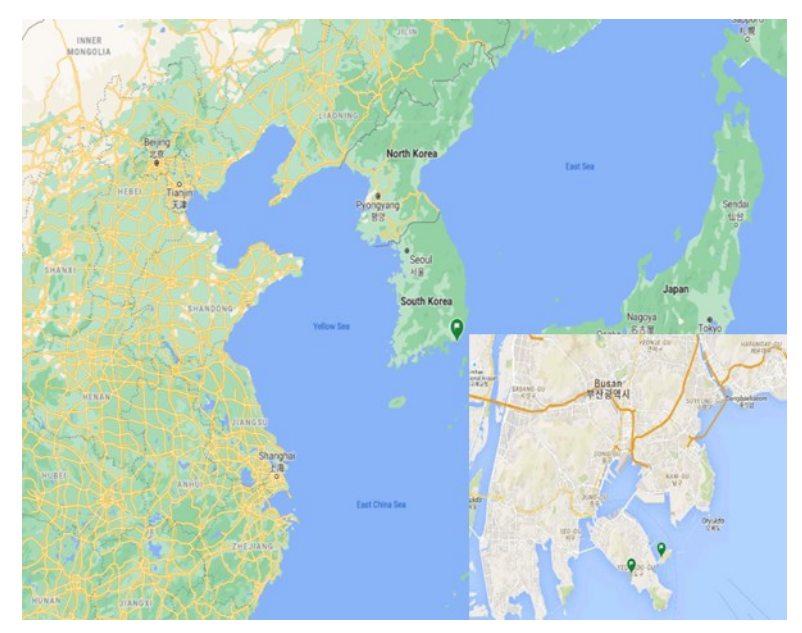
Figure 1. Map of Yeongdo island, Busan, Korea showing the collection sites (indicated by Google).

reaction included a 2 \mu L DNA template, except sample A (3 \mu L DNA template used). It contained two 12.5 \mu L Lamp Taq PCR Master mixes (Biofact, Daejeon, South Korea) and a 1 \mu L primer mix (each 10 pmol/ \mu L), made up to 25 \mu L with distilled water. The thermocycling regime consisted of one cycle of 1min at 95 °C, 35 cycles of 20 s at 95 °C, 40 s at 50 °C, 1 min at 72 °C, and finally 5 min at 72 °C. Then, 2% agarose gels were used to screen for amplification success and sent out for DNA sequencing (Biofact, Daejeon, South Korea). The sequence was subjected to a BLAST search on NCBI to identify the most similar sequences in the database.